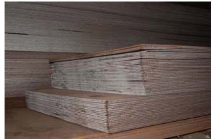
Mild Steel Hot Rolled Plate ( Germanischer Lloyd's Shipbuilding Plate )