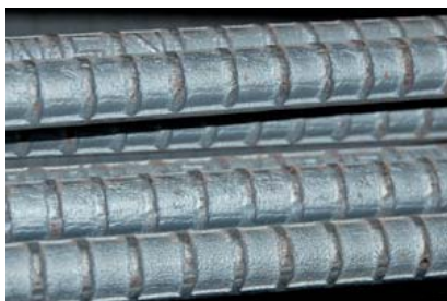
Deformed Bar 40 Grade