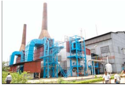
30 MW Power Plant