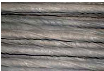
Cold Twisted Bar ( TISCON )