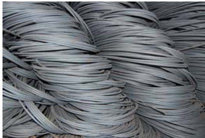
60 Grade Deformed Bar