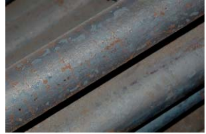
Shaft/ Round Bar